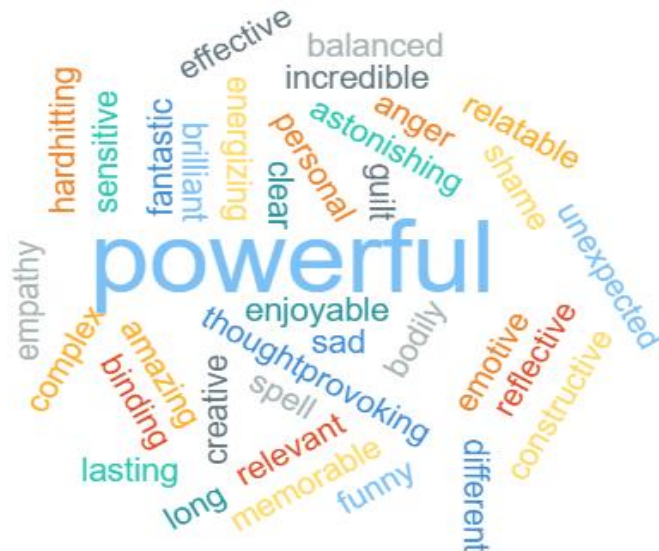
Fig1: Word Cloud generated from audience feedback.