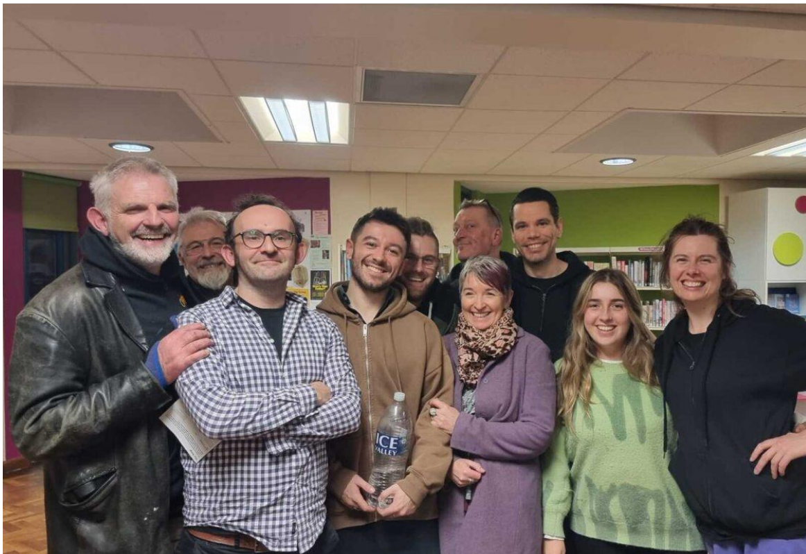
Photo of the project team and actors after the final performance.

'How's Your Father?' is an innovative, creative, and powerful approach to developing professional practice with men and with fathers. It has collaboration at its heart, and this is an integral part of its success. The 2023 tour demonstrated very clearly that the live show and supporting training resources worked for social workers, and was a highly effective way to provoke reflection, recognition, curiosity, empathy, and motivation to do better. Whilst there were limitations in terms of the logistics of scheduling a viable tour, the realities of the intense demands on social workers' time, and in terms of the stories of fatherhood we foregrounded, and those we have not (yet) told, the project was successful in its aims and objectives. It was ambitious and challenging but has demonstrated the value of applied theatre in social work education and professional development, perhaps especially for digging into topics that might be perceived as 'hard to reach'. The tour established 'proof of concept', strengthened our relationships with the participating local authorities, and helped to identify a trajectory for potential future work. We look forward to exploring that trajectory in the coming months and continuing to pose the question 'How's Your Father?'