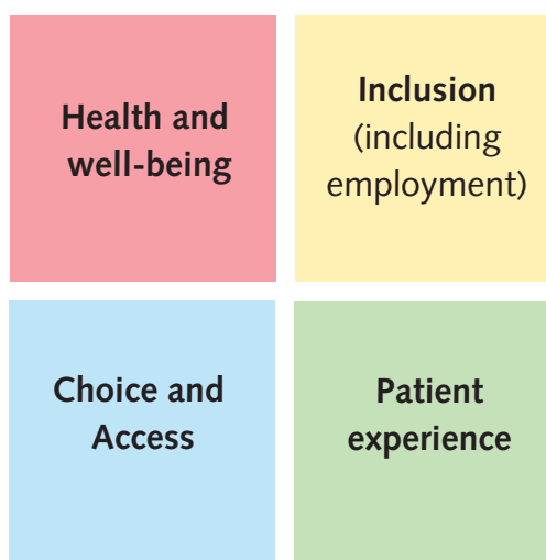
Figure 2 Health and well-being outcomes framework