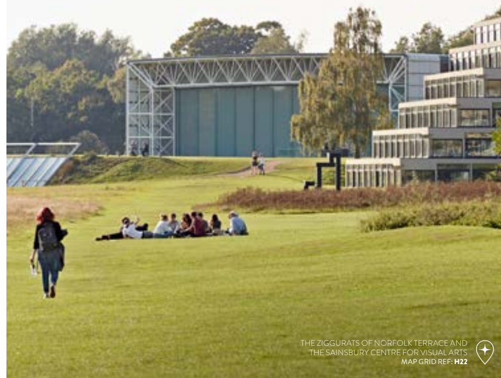
THE ZIGGURATS OF NORFOLK TERRACE AND THE SAINSBURY CENTRE FOR VISUAL ARTS MAP GRID REF: H22