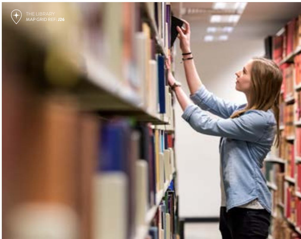
THE LIBRARY MAP GRID REF: J26