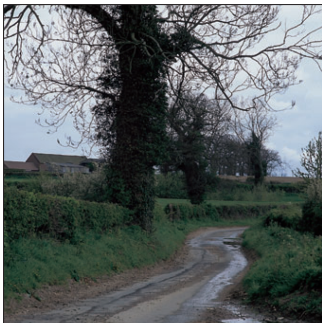
JOHN TYLER COUNTRYSIDE AGENCY

Central North Norfolk is bounded to the north by coastal cliffs and the Cromer Ridge which has a steep north slope and a more gentle slope to the south. This ridge extends from Holt to Mundesley but is most pronounced in the vicinity of Sheringham, where it reaches 100 m in height, with an average width of five miles. It is not, in national terms, a major landscape feature but an unusual one in East Anglia and of great interest geologically. This vestige of a former glaciation, with its mix of till (silty clays), sands and gravels, has provided the complexity of the soils in this area which give rise to great variation in land cover. Coastal erosion of the cliffs is an ongoing problem but the cliff-line remains a dramatic feature, contrasting with the open, flat coastline elsewhere in East Anglia.