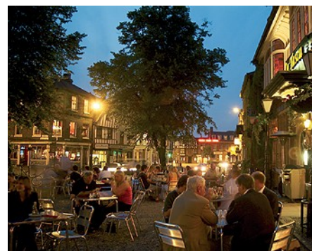
Restaurants on Tombland

Keynote speaker's dinner from 8pm at By Appointment.