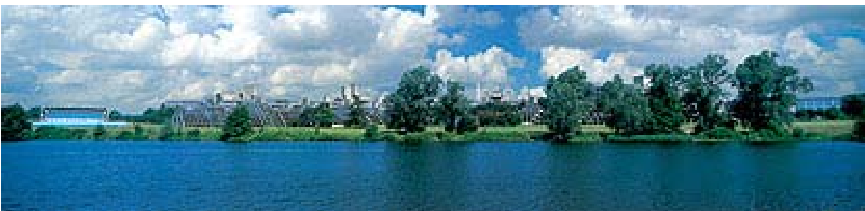
The university campus with the Sainsbury Centre on the far left