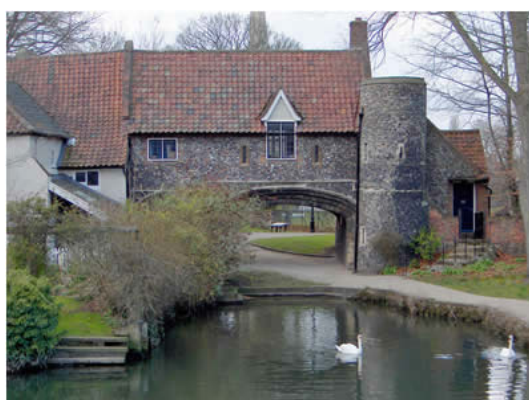
Puller Ferry on the River Yare