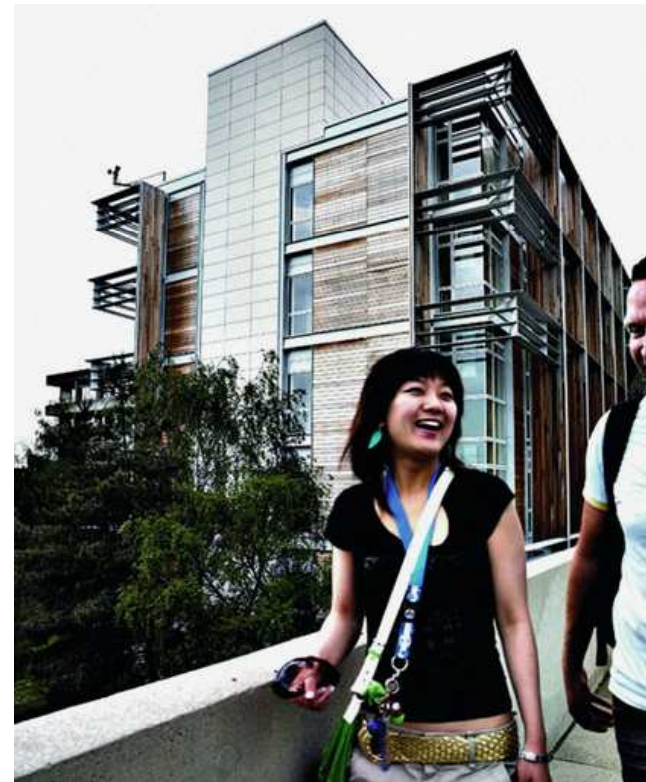
UEA – Students outside the library