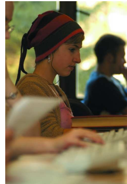
UEA – Students in the library