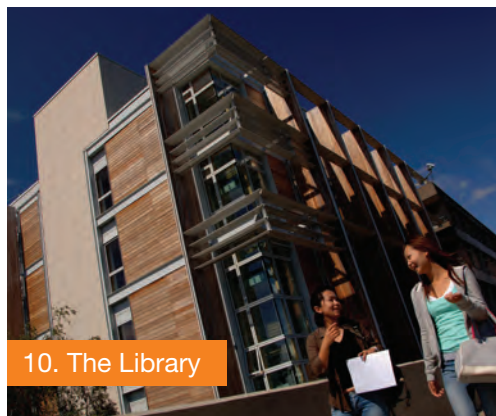
10. The Library

From WATERSTONE'S bookstore (across from the UNION HOUSE on the upper ground level), continue following the walkway straight ahead. The large buildings in front of you house the LIBRARY and main LECTURE THEATRES . Turn left and go towards the walkway to your right. Pause as you reach the walkway, in front of you is the DEAN OF STUDENTS' OFFICE , who provide a variety of support services for students, and the CAREERS CENTRE . Turn right over the walkway and head towards the LIBRARY and main LECTURE THEATRES where the majority of lectures take place.