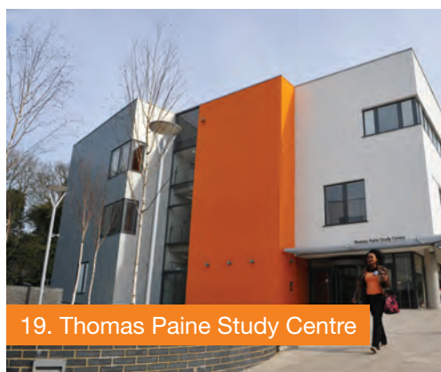
19. Thomas Paine Study Centre